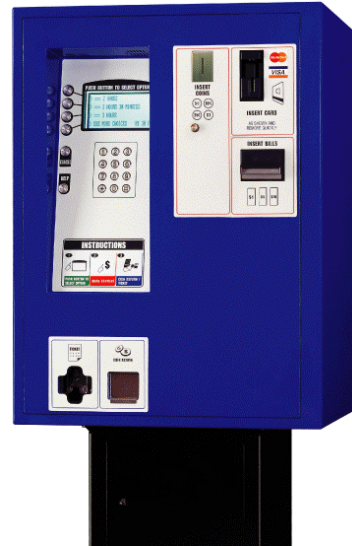
Model “XC” in blue